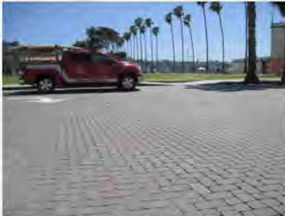
Location: Kellogg Park, San Diego, California