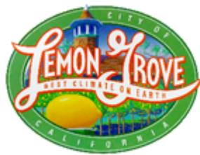
Shelley Chapel, MMC