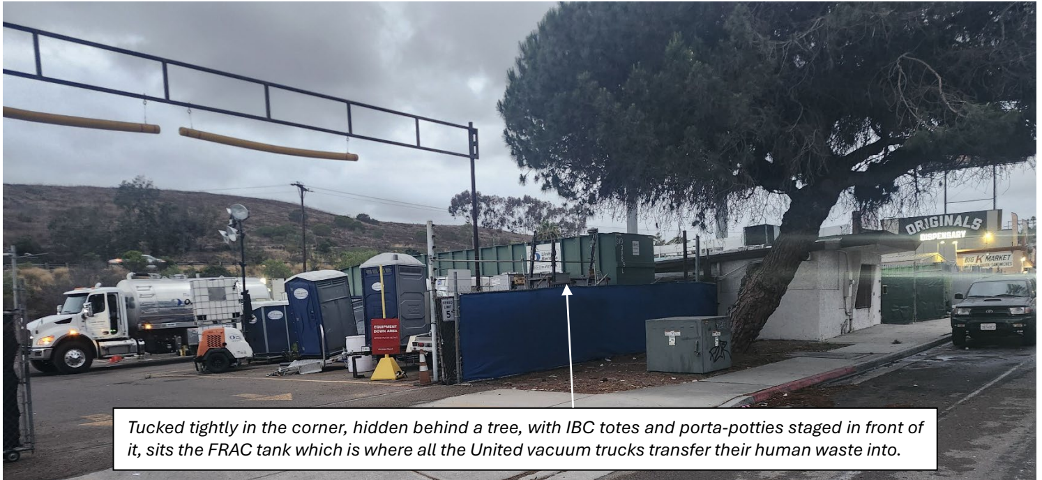
Tucked tightly in the corner, hidden behind a tree, with IBC totes and porta-potties staged in front of it, sits the FRAC tank which is where all the United vacuum trucks transfer their human waste into.

Porta-Potty Rentals Main Human Waste Processing Center at 6144 Federal Blvd. SD CA 92114